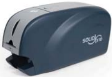
Single sided ID CARD PRINTER SOLID-310S