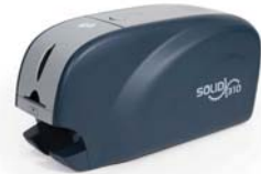
Rewritable ID CARD PRINTER SOLID-310R