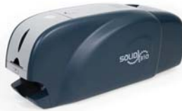
Dual sided ID CARD PRINTER SOLID-310D